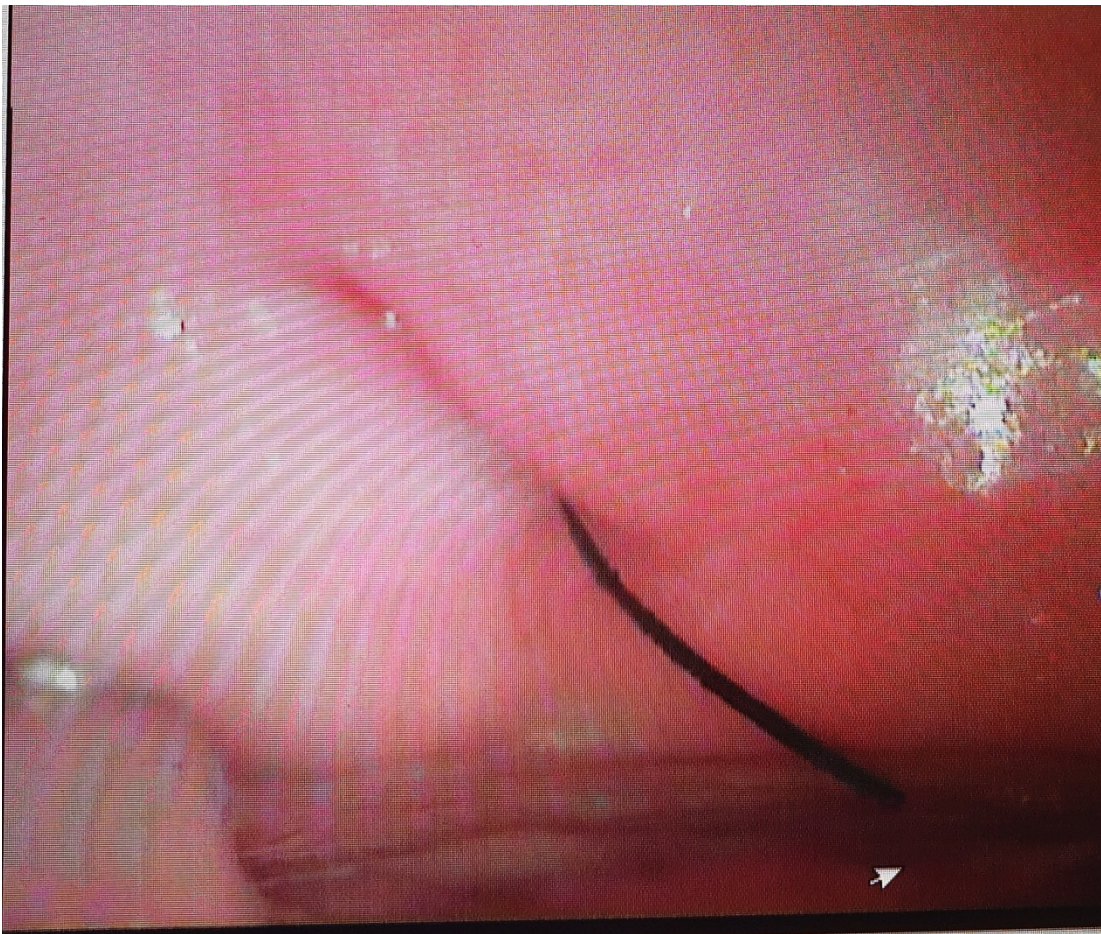
Fig.1 Image of IUD threads protruding through cervical os.