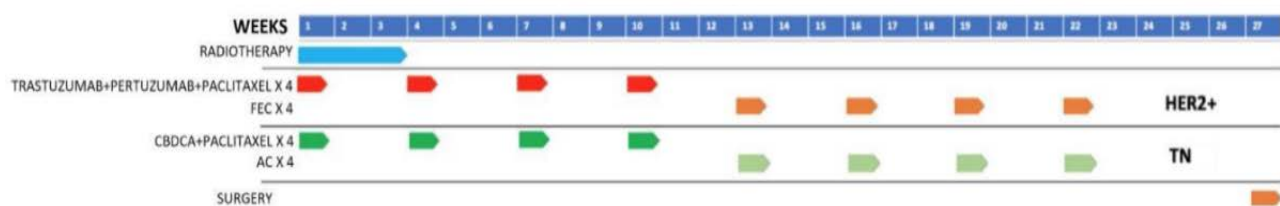
Figure 2. Chemoradiation treatment scheme.

Treatment scheme is represented in figure 2.