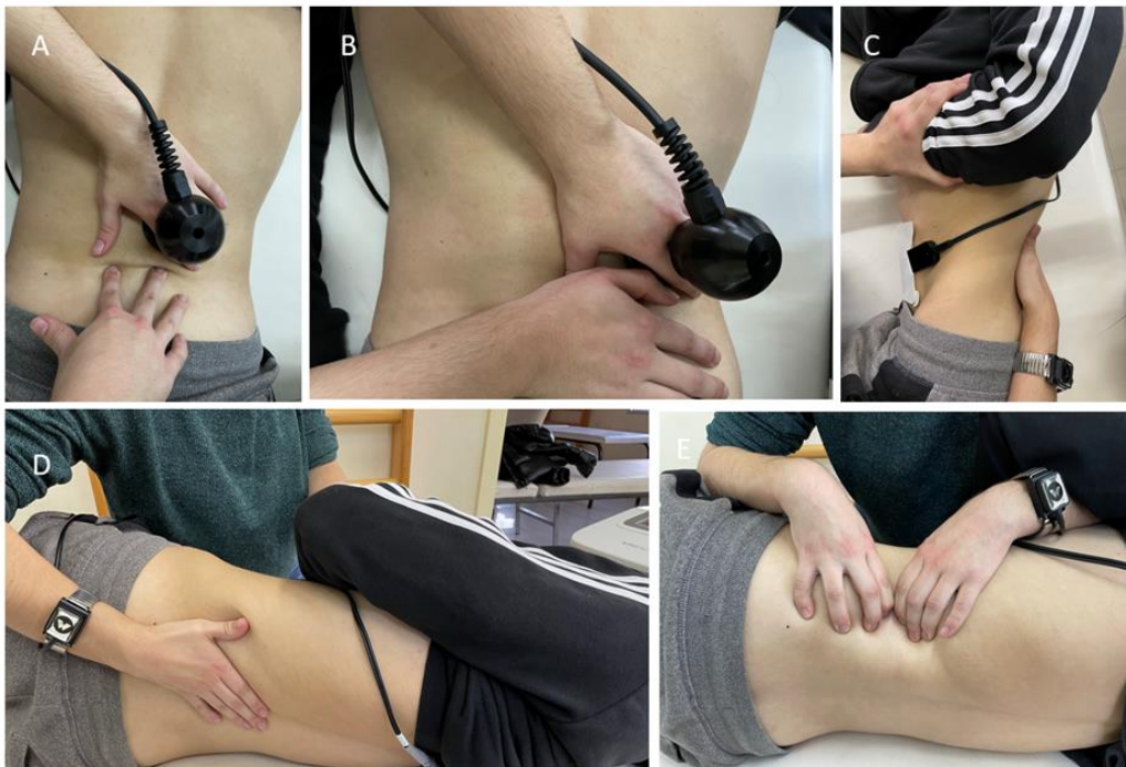
Figure 1. MT protocol with TECAR (A) Lumbar cranial and lateral mobilization through capacitive conventional electrode, (B) Medial lumbar soft tissue mobilization with capacitive conventional electrode, (C), (D) Extension with coupled rotation and side bending mobilization through resistive bracelet electrode, (E) Functional massage on the quadratus lumborum muscle through resistive bracelet electrode.

The participants of this group followed the same MT protocol as the first group with the addition of high frequency current with the WinBack – TECAR device (WINBACK 3SE, Villeneuve Loubet, France). Soft tissue mobilization manipulations were applied in combination with a capacitive conventional electrode and with a special electrode bracelet that made the therapist's own hand function as a resistive electrode. The frequencies of the high frequency current were 300kHz, 500kHz, and 1MHz, while as a reference electrode a flexible self-adhesive ground was used placed on the abdomen. Application of manual therapy protocol with TECAR is presented in Figure 1.