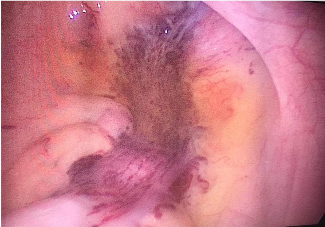
Figure 2. A diffuse distribution of intestinal wall hemangioma in the distal rectum and sigmoid colon, with prominent anterior wall, and a distribution of vascular malformations in the pelvic soft tissues.