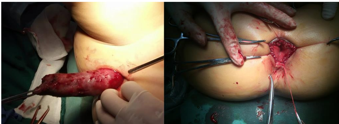
Figure 3. After changing to lithotomy position. The colon was pulled out of the anus. The edge of the rectum to the dentate line was resected, 1.5cm of the anterior wall and 0.5cm of the posterior wall of the rectum were retained, and the sigmoid colon was cut in the reverse oblique, and then the end-to-end heart-shaped anastomosis was performed with the rectum. .

The operation time was 170 minutes, blood loss was 20ml, intraoperative blood transfusion was not required, and the patient recovered well after the operation. The gastric tube was removed on the 3rd postoperative day, and oral administration was started on the 5th postoperative day. The anal canal was removed on the 8th postoperative day and the patient was discharged on the 14th postoperative day. The patient was followed up for 1 week /1 month /3 months /6 months /13 months /24 months and no obvious signs of recurrence were found by ultrasound. After the operation, the child had short-term fecal incontinence and loose stools, which returned to normal after half a year.