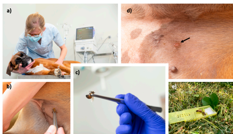
Figure 1. Presentation of the in-clinic challenge with a bee. Patients are closely monitored during in-clinic challenge (a), the insect is gently grabbed by forceps and brought to the skin in the inguinal area (b, c). In case of bee stings, their stinger is removed after few minutes. At the stung area, a well-defined erythematous wheal (arrow) should appear (d). If no reaction is observed, the procedure is repeated with a new insect. Finally, the remaining insects are transported back and freed into their natural environment (e).

The efficacy was determined either by accidentally occurring stings, or an in-clinic challenge after 6 months (Figure 1), as published previously for humans undergoing VIT.[28] For the in-clinic challenge, the insect used was entomologically identified. Only bees which were already able to leave the nest were used (preferentially guardians at the entrance). Wasps were collected in nature close to their feeding sources with the help of attraction with foods. Insect handling during insect transportation or storage can lead to venom loss, which was reduced as much as possible. Insects were used within 12h.