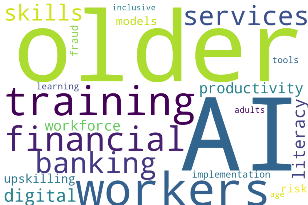
Figure 1. WordCloud for this Work