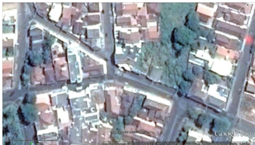
Figure 1. Study Area Image, [32].

A study area in the city of Monte Carmelo (Brazil, MG) was selected to support the map project (Figure 1). The selected area corresponds to the central part of the city, with flat relief. This area was selected in reasons to be a representative area of the city, according to the characteristics of the existing resources.