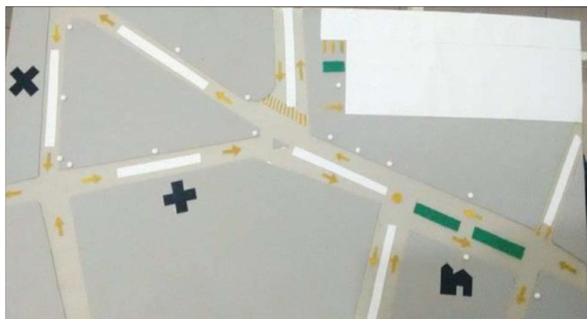
Figure 2. Tactile Model: Study Area

to the road that is signaled by means of Braille writing, there is still the demarcation of a central bed separating a road, it is represented in green with a velvety texture. The direction of the track is represented by an arrow with sandpaper texture indicating its direction, this indication is too important for decision making when moving on the tracks.