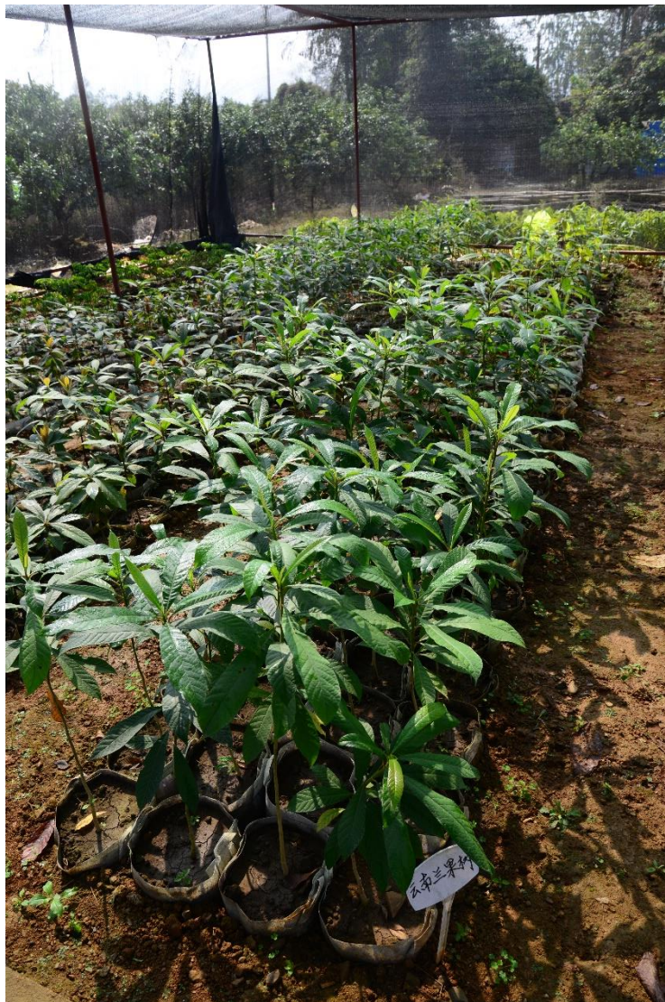
Figure 1. Photograph of Nyssa yunnanensis from Ruili, Yunnan Province, China.