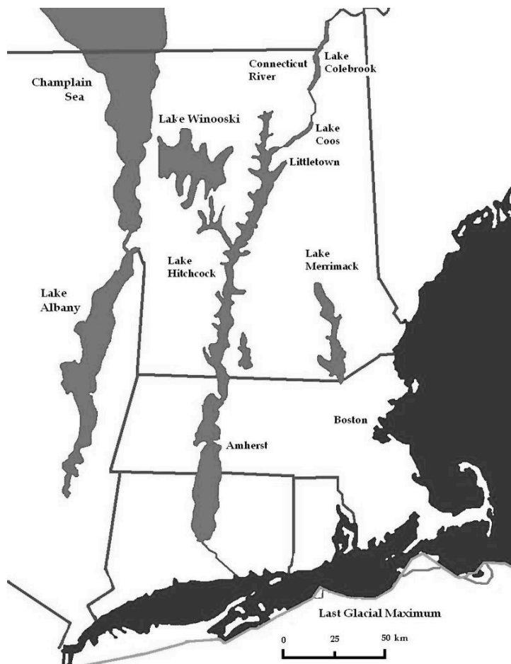
Figure 1. Proglacial and prehistoric lakes of New England during the end of the Wisconsin Glacial Epoch of the Pleistocene Era. 9

has been considered by some authors. 8 The effects of chronic low-level exposure are also of potential concern to scientists, but have not been well-determined. 8 Clay minerals can also bind and store a variety of toxins. Bio-accumulation of clay minerals, manganese, or both in fish or seafood that is then frequently consumed is another potential source of human exposure to these substances in ALS-affected regions. A large portion of the affected area sources drinking water from Lake Champlain. Drinking water is obtained from wells or other sources in much of Vermont as well. In general, very small clay minerals can potentially remain in drinking water despite standard efforts at water monitoring and treatment, and these levels can increase or decrease at any given time depending on a variety of environmental conditions.