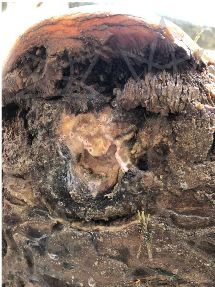
Image 6. Nail 4 RFL, December 10, 2020, after two weeks on CBD treatment. The white foam is residual antiseptic.