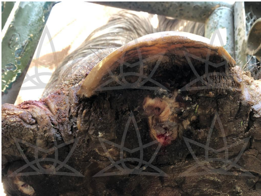
Image 5. Nail 4 RFL, December 6, 2020, after nine days on CBD treatment.