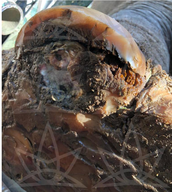
Image 1. Fourth nail/h hoof of the right forelimb (RFL), August 9, 2020.