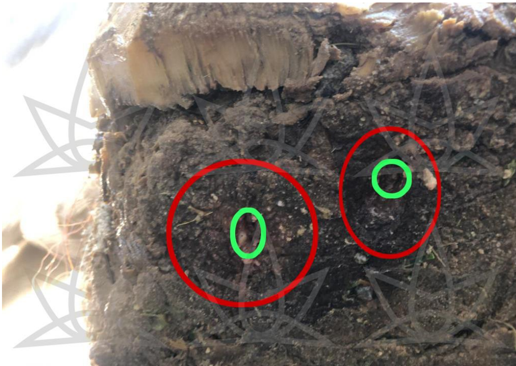
Image 7. Nails 4 and 5 RFL, December 26, 2020. The image shows the extent of the lesions before treatment with CBD (red circles) and after four weeks of treatment with CBD (green circles).