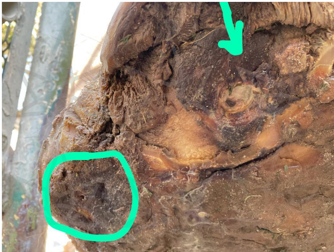
Image 8. Nails 4 and 5 RFL, January 16, 2021, after six weeks of CBD treatment. The image shows the size of the opening of the nail 5 abscess, which is nearly imperceptible (green circle), and the manual filing down of the tissue in nail 4 to allow the wound to close from the inside (green arrow).