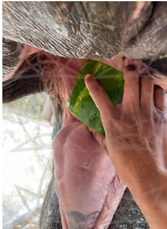
Image 4. After depositing the medication behind the tongue, the patient is given a piece of fruit so that she swallows the medication and fruit together.