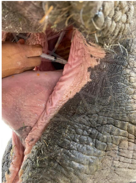
Image 3. The patient has a prior training in protected handling; she opens her mouth and allows depositing the medication directly into the oral cavity.