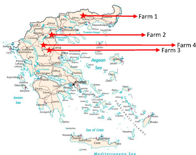
Figure 2. Localization of the farms with indigenous Greek black pigs analyzed here.

Twenty-one animals from 4 farms in Greece (Figure 2) were analyzed using real-time PCR for PCMV/PRV, PCV2, PCV3, PCV4, PLHV-1, PLHV-2 and PLHV-3, as well as real-time RT-PCR for HEV. For the detection of PERV-C and PERV-A/C conventional PCRs were used. In addition, 11 animals from two farms were screened for antibodies against PCMV/PRV using a Western blot assay.