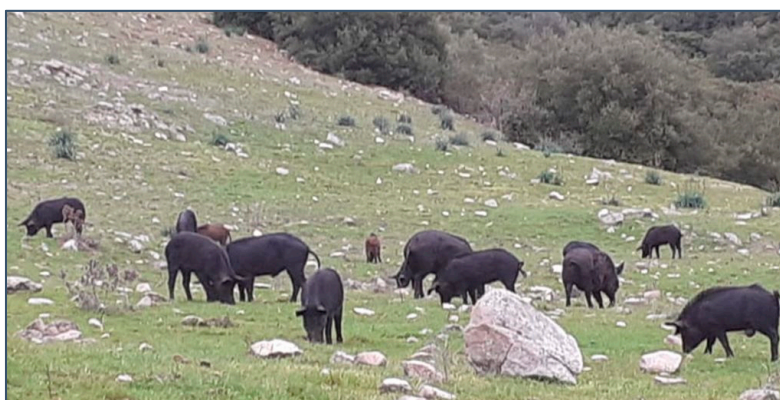
Figure 1. Indigenous Greek black pigs on a mountainous pasture in Greece.

Here, we analyzed the indigenous Greek black pigs (Figure 1) using these methods. This breed is the only traditional indigenous pig breed reared in Greece. Most interestingly, it has its roots in ancient Greece. It is thought that these are the pigs from the Odyssey in the farm of Odysseus with his swineherd Eumaios [35].