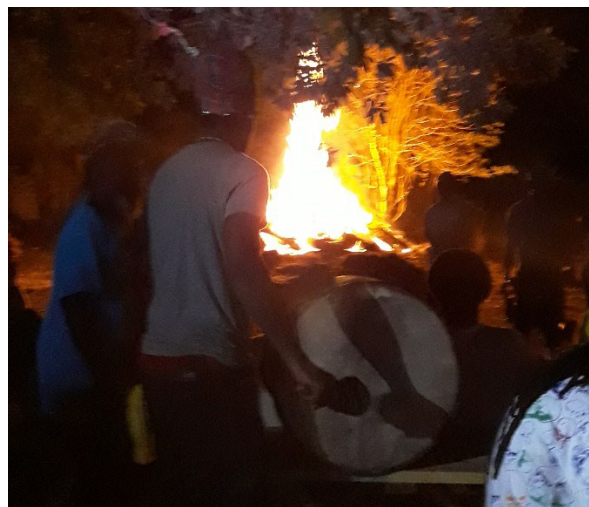
Figure 6. a & 6b. Maroon fires during a religious Myal ceremony in the Blue Mountains, Jamaica. (© Jones Collection).

Despite the environmental concerns raised by such practices, the nuanced recognition of Maroon sovereignty by the state introduces a complex legal and jurisdictional landscape, thereby limiting the capacity for regulatory enforcement. Even with a predisposition towards engaging the Maroon community to mitigate the frequency and impact of forest fires, such an approach necessitates navigation across the intricate socio-legal terrain that delineates Maroon territories, thus presenting a formidable challenge in conservation efforts.