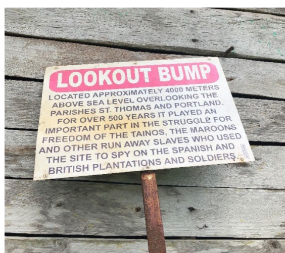
Figure 4. One of several signs reflecting Maroon land ownership in the BJCM.

Participant observation within the Maroon communities and among Park Rangers provided invaluable insights into non-verbal communication, the intricacies of interpersonal dynamics, and direct observations of governance practices. This immersive approach was pivotal for triangulating data and crafting a nuanced, interpretive analysis of the findings. Our participant observation was particularly instrumental in uncovering the subtleties of Maroon governance practices and their evolving responses to environmental and intra-group challenges. Therefore our interactions with the Maroons and Park Rangers allowed us to observe and document the lived realities of environmental governance in the BJCM, facilitating a holistic understanding of the socio-environmental dynamics at play.