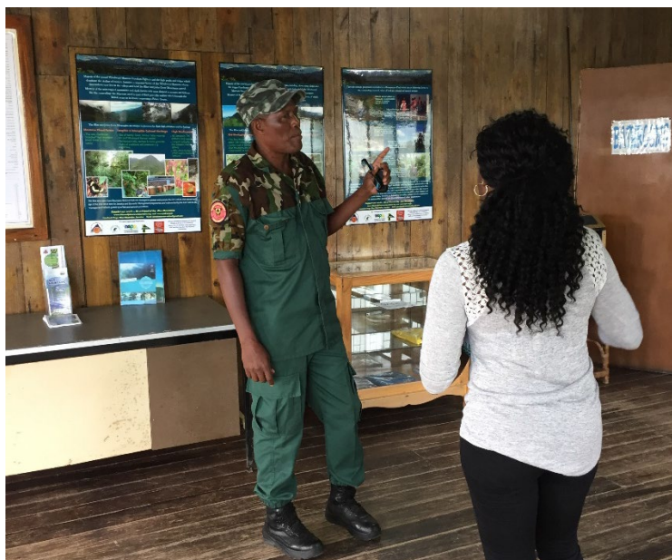
Figure 9. In the BJCM with a Senior Park Ranger.

The observable reticence of Park Rangers to exert authority over Maroon entities underscores a broader reluctance on the part of the Jamaican state to fully leverage its legal apparatus in the governance of Maroon territories. Consequently, the onus of decision-making in response to environmental transgressions is predominantly placed upon the Colonels within the Maroon hierarchy, who deliberate on whether to engage state mechanisms for remedial actions. Nonetheless, the Maroons' predilection for basing enforcement decisions on supernatural rationales further entrenches a prevailing distrust towards state entities. This inclination not only reflects deep-seated cultural and spiritual values but also underscores a political strategy aimed at preserving the opacity of Maroon authority. Such practices serve to safeguard the autonomy of Maroon governance structures, yet they also perpetuate a cycle of mutual suspicion and limited cooperation between Maroon communities and state regulatory bodies, complicating efforts towards unified environmental stewardship.