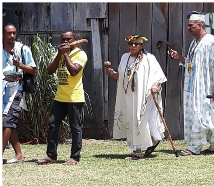
Figure 5. Maroons during a religious Myal ceremony in the Blue Mountains, Jamaica.

This further reflects that the current legal dynamics between the Maroons and the State are rooted in a historical continuum of resistance against subjugation.