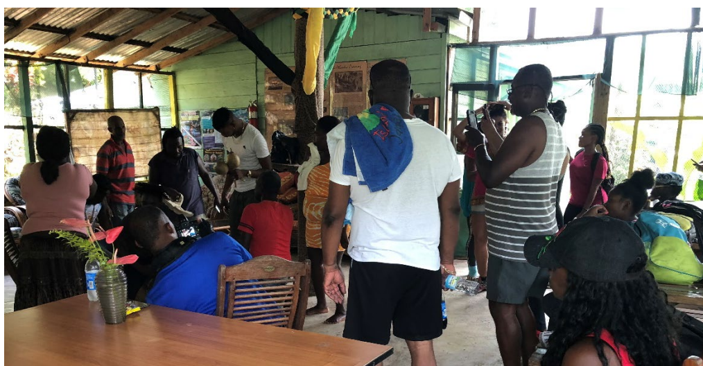
Figure 3. A Maroon community meeting.

The foundational pillar of Maroon Indigenous jurisprudence is rooted in traditional customs, with oral histories serving as the conduit for the transmission of legal principles within Maroon society (Besson, 2016). These oral traditions not only delineate land rights and the framework for political governance but also embody the ethos of the community's legal and normative order. Significantly, the process of law-making within Maroon communities is characterized by its inclusivity and democratic ethos, with community assemblies playing a pivotal role in the formulation and ratification of legal resolutions. This participatory approach underscores the democratic underpinnings of the Maroon legal system, where community consensus is integral to the legislative process.