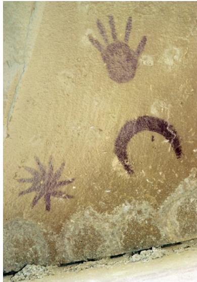
Figure 3. The most famous “Supernova Pictograph” at the Penasco Blanco Canyon (New Mexico). The Supernova is as big as the Moon. In our vision this was the dawn of July 3rd, 1054 at 11 UT with the GRB exploded, around 10^\circ above the East horizon still dark.