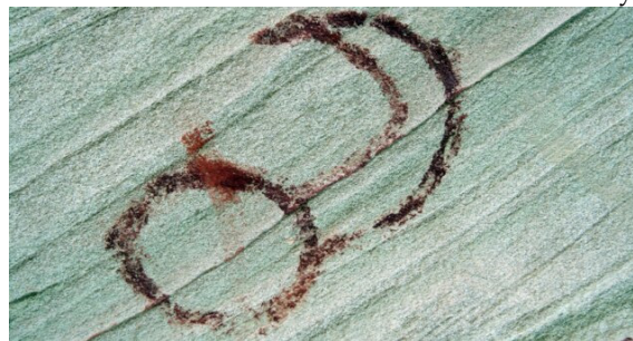
Figure 2. Pictograph at the White Mesa (Arizona) already interpreted as the Crescent of the Moon and the Supernova since 1955. As other pictographs of this type the star appears always of similar size to the Moon, rayed or surrounded by circles, as the case of fireball.

Our hypothesis on the explosion of the Supernova-induced GRB around 11 UT of July 3rd would explain why that new star is so big to appear as an orb : they may have assisted to this explosion at dawn, with the phenomenon very close to the eastern horizon, of an unprecedented brightness, second only to the Sun. A few degrees from the horizon ( 10^\circ for New Mexico at 11 UT of July 3rd) the luminosity of the GRB could have been even brighter than the Sun at the horizon, while the nearly 5 airmasses would have shield better the native Indians from Gamma-rays' effects.