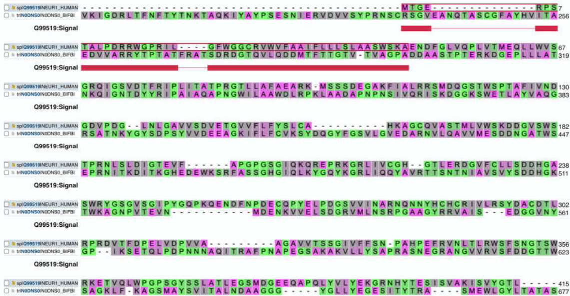
Figure 1, shows the degree of identity and helix propensity in the region where the two sequences were aligned.

Next, the amino acid sequences of beta-galactosidase and sialidase from Bifidobacteria (Hsu et al. 2005; Nishiyama et al. 2018) and humans were compared. These two enzymes were chosen because they are responsible for the production of GcMAF, a potent activator of macrophages, from the Gc protein that is abundant in colostrum (Ruggiero et al. 2016; Nabeshima et al. 2020); it had been previously demonstrated that the product object of this study has a very high GcMAF activity (Carter et al. 2020), possibly due to the enzymatic conversion of the Gc protein by these two enzymes released by Bifidobacteria.