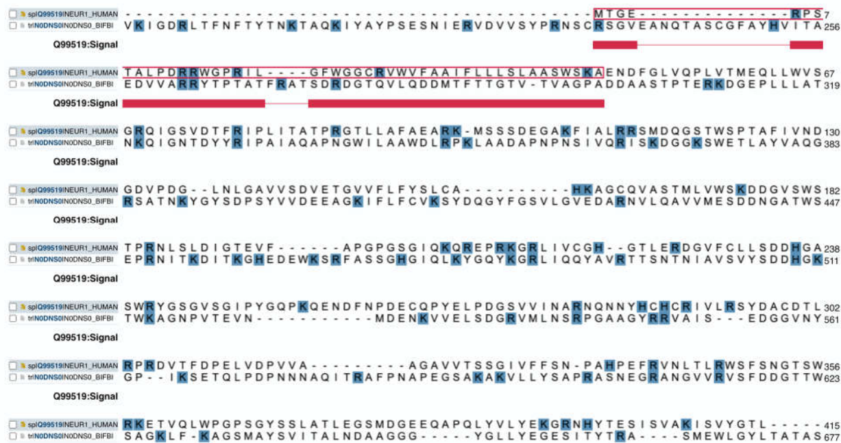
Figure 2. Results of alignment of human sialidase (Bonten et al. 1996. Upper line) and extracellular sialidase SiaBb1 from Bifidobacterium bifidum (Nishiyama et al. 2018). Histidine (H); Arginine (R); and Lysine (K) are highlighted.

Figure 2, shows the results of alignment where positively charged amino acids are highlighted. The rationale for the choice of positively charged amino acids lays in the interaction with the negatively charged sialic acid of GcMAF.