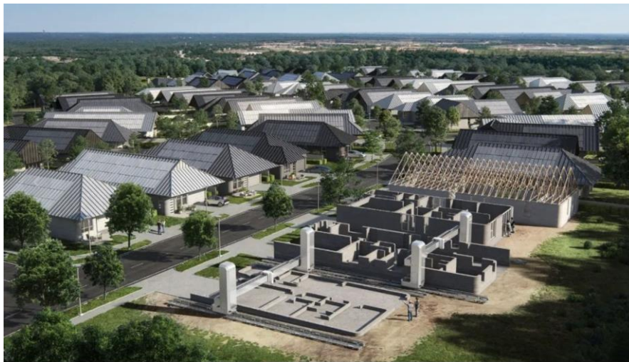
Figure 3. The world's largest automated 3D building project is being implemented in Georgetown, USA.

Digital twin buildings are 3D visual replicas of physical buildings. With it, architects have a constantly evolving model to test their ideas in a virtual environment. Digital twin buildings allow long-term comparison of digital models with physical buildings. [17] This technology can also assist in selecting building materials and processes that reduce carbon emissions over the life of a building. The technology itself does require a lot of energy, but the application of this technology can significantly reduce the energy consumption of buildings. For example, Dutch architects used digital twins to reduce the energy consumption of the Hague City Hall by 39%.