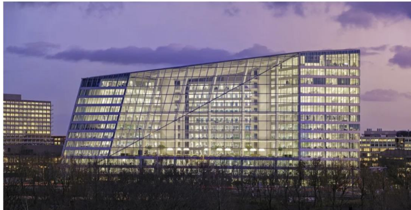
Figure 4. The Edge Building in Amsterdam, also known as the "Computer with a Roof."

need for strict standards and good governance locally and globally. The building information model also has "smart management" features, such as the Edge building in Amsterdam, dubbed "the world's smartest building," which allows users to interact with the building through a smartphone app, including reserving workspaces, controlling lights and adjusting the temperature of the space they are in.