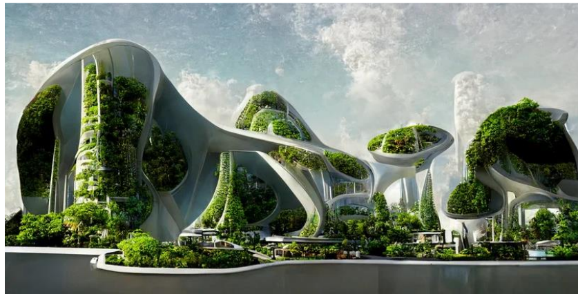
Figure 5. Skyscraper green vertical garden.